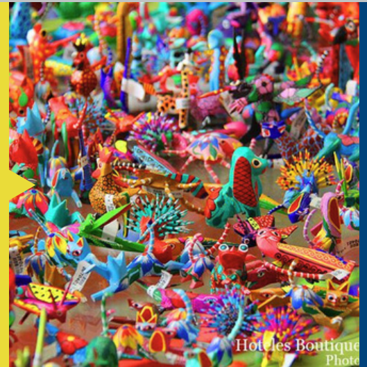
Hotels Boutique Photo